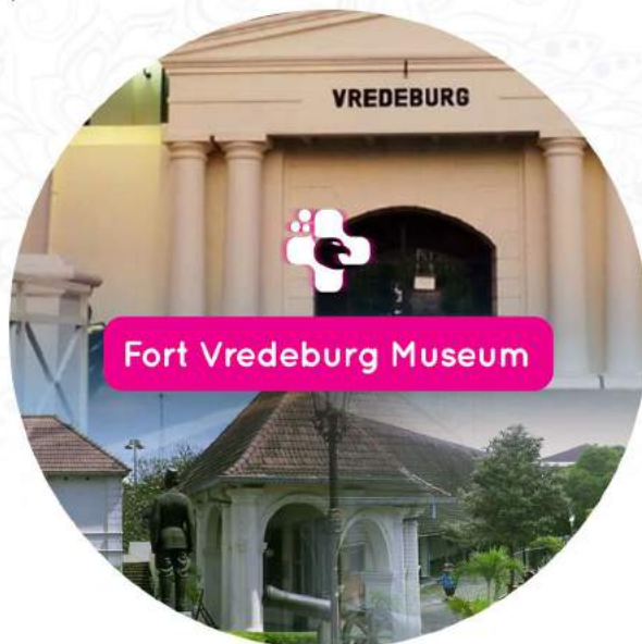
Fort Vredenburg Museum