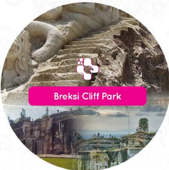
Breksi Cliff Park