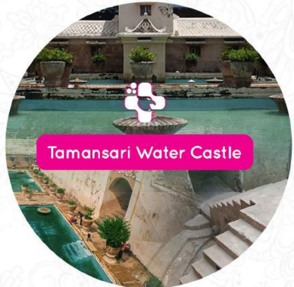
Tamansari Water Castle

Taman Sari is the site of a former royal garden of the Sultanate of Yogyakarta. Built in the mid-18th century, it served as a resting area, a workshop, a meditation area, a defense area, and even a hiding place.