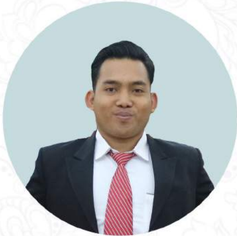
PRESIDENT OF INDONESIAN MEDICAL STUDENT EXECUTIVE BOARD'S ASSOCIATION (ISMKI) 2018/2019